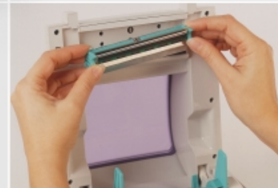
Tool-less replacement of the printhead.

The B-SV4D is a small (200 mm x 231.8 mm) and light (2 Kg/ 4.4 lbs. excluding media & AC adapter) printer which can be installed immediately in any convenient place.